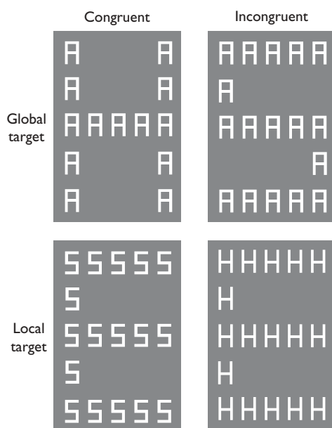
Fig. 1 Illustrations of compound stimuli used in the current experiment.

Reaction times to global and local targets in the congruent (the target and the distractor in a compound stimulus were similar) and incongruent (the target and the distractor in a compound stimulus were dissimilar) conditions are calculated separately (Fig. 2). The analysis comparing rTMS over P3 vs. CZ showed a significant main effect of interference [ F(1,17)=171.93 , P<0.001 ], reaction times to targets were shorter in the congruent than the incongruent conditions. A reliable interaction effect of globality × interference [ F(1,17)=21.21 , P<0.001 ] was observed, suggesting a stronger global-to-local interference than local-to-global interference. Interestingly, we found a significant interaction of globality × TMS [ F(1,17)=5.19 , P<0.05 ], reflecting the fact that global and local responses were equally fast when rTMS was applied to CZ whereas global responses tended